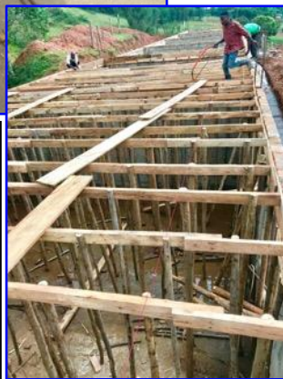
BOTTOM Left: Preparation for constructing the 2 nd floor of the classroom building.