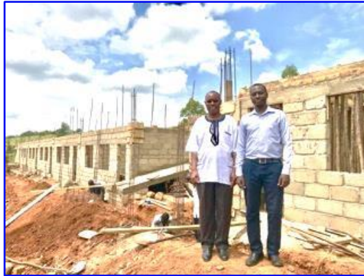
TOP Left: Walls of first floor of classrooms going up. Each room will have window in front & back for cross-ventilation.