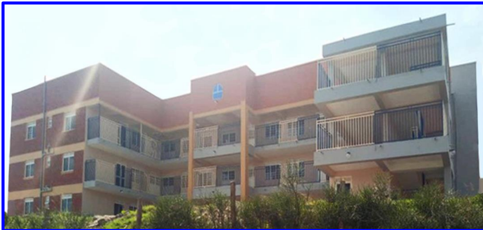
Front view of Harmon Hall, the girls' dorm, which faces the east. Each level will house 80-100 students, and provide a small apartment for one teacher.

While the students were on their long break, workers were getting the school ready for the 2020 school year. The dormitories were finished in time for move-in on Feb 1!