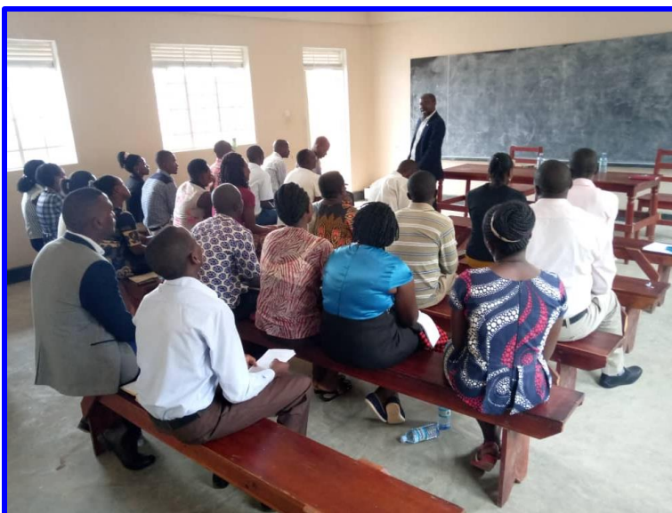
Staff meeting on Friday, 1/31, the day before the boarding students arrived