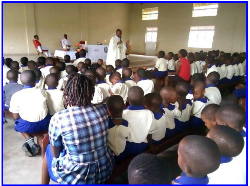
One look at the student body during Mass leaves no doubt that a larger chapel is going to be needed very soon!