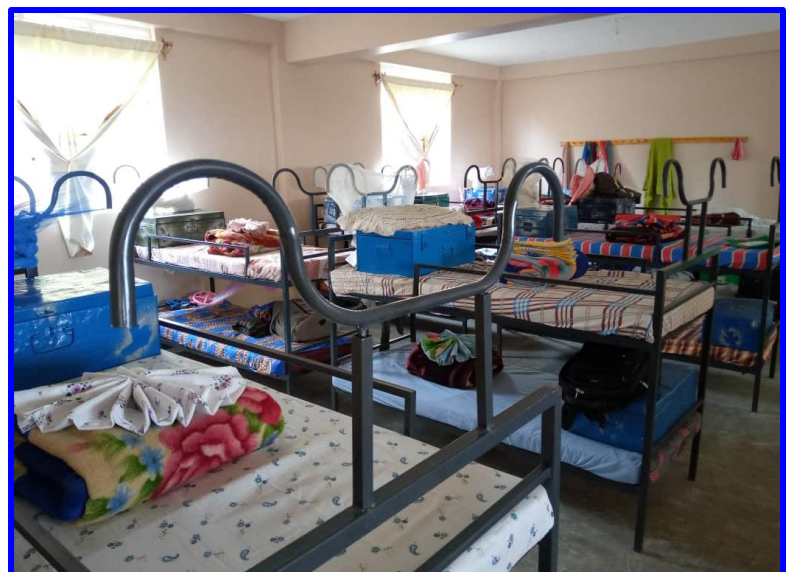
One of the dormitory rooms (Definitely looks like it could pass any inspection!)