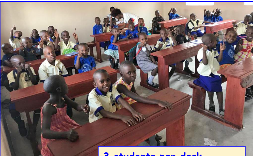
3 students per desk - - Can you imagine that here?