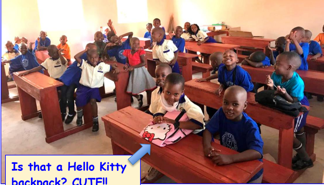
Is that a Hello Kitty backpack? CUTE!!