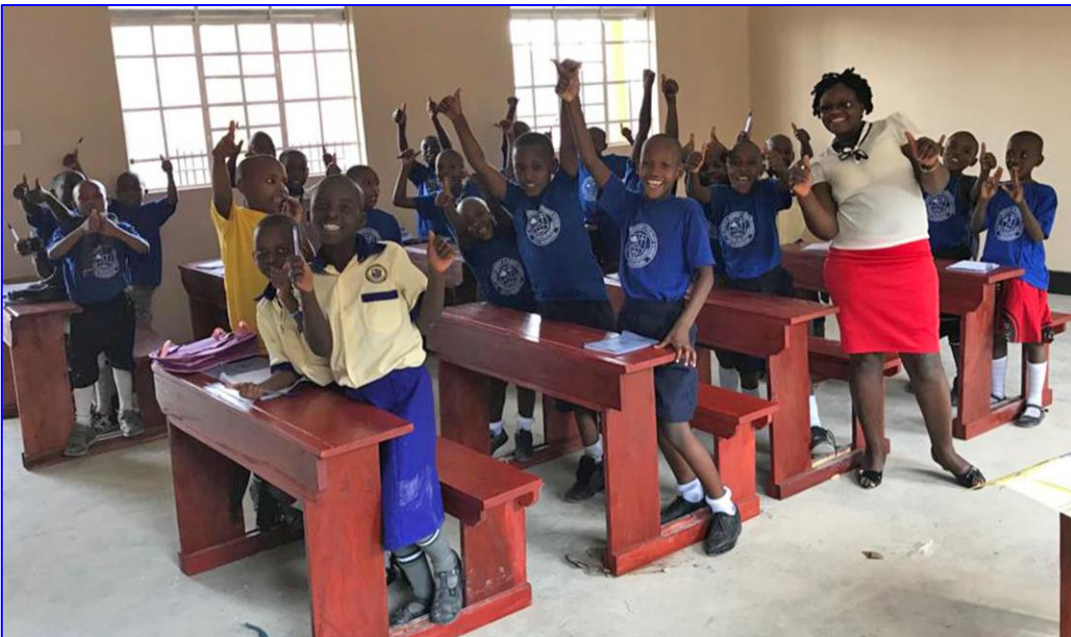
It looks like this is going to be a fun classroom!