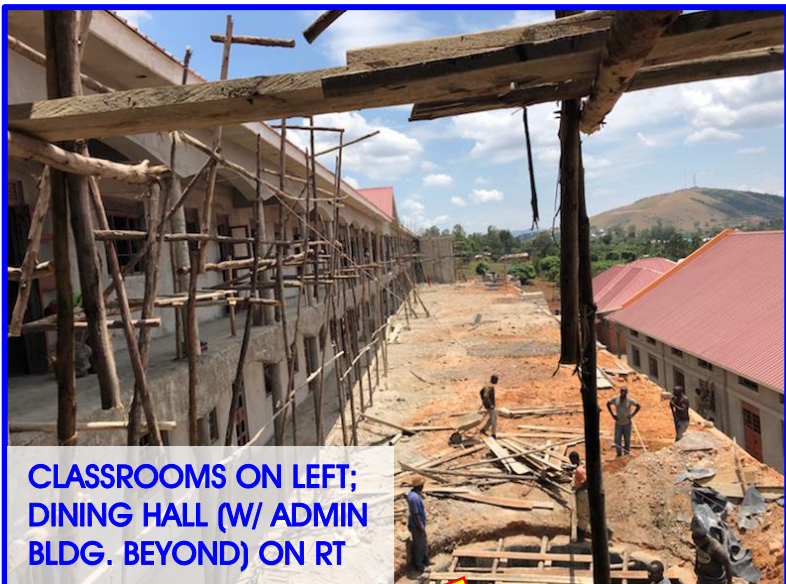
CLASSROOMS ON LEFT; DINING HALL (W/ ADMIN BLDG. BEYOND) ON RT

CISTERN FOR RAIN WATER GAL. THERE ARE 2 THIS SIZE