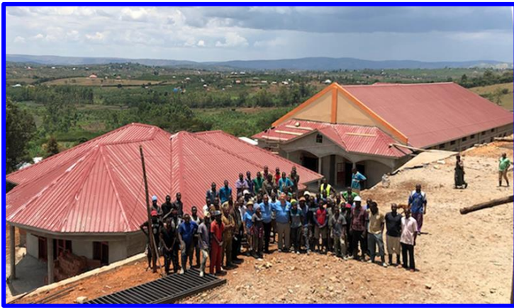
WORKERS, ADMINISTRATORS AND VISITORS ALL POSE FOR A PHOTO ON TERRACE THAT WILL EVENTUALLY BE A GRASSY GATHERING AREA IN FRONT OF THE CLASSROOM BLDG. WHAT A VIEW!