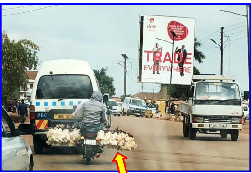
MOTORCYCLES CALLED BODA-BODAS ARE USED AS TAXIS & FOR HAULING INCREDIBLE TYPES OF FREIGHT (INCLUDING CHICKENS, AS SHOWN.)