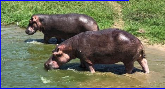
VISITORS AND RESIDENTS OF QUEEN ELIZABETH NATIONAL PARK, UGANDA