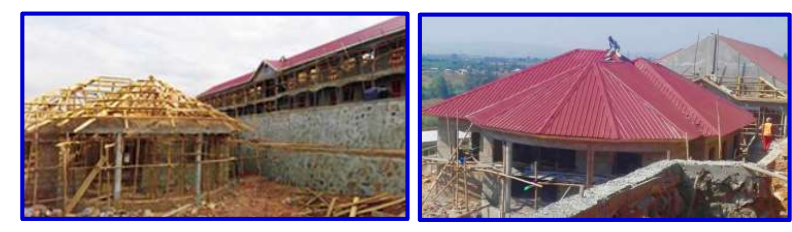
July 11: The Classroom Block (upper rt.) sports its new red roof. In front of the 2-level stone retaining wall is the portico being added to the front of the Administration Building.

May the God of hope fill you with all joy and peace... Rom 15:13