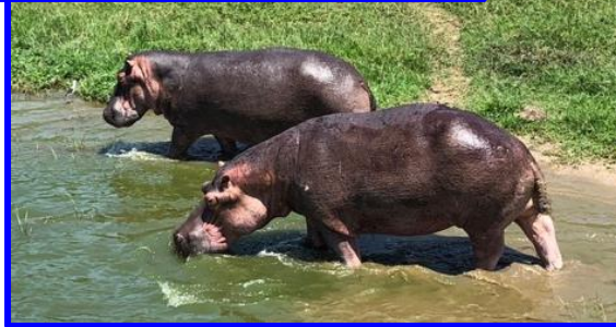
VISITORS AND RESIDENTS OF QUEEN ELIZABETH NATIONAL PARK, UGANDA