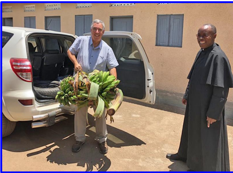
FATHER CELEBRATED MASS AT ST. AUGUSTINE CHURCH IN NOOZI, HIS HOMETOWN. THE PEOPLE GIFTED HIM WITH A LARGE BUNCH OF BANANAS.

MOTORCYCLES CALLED BODA-BODAS ARE USED AS TAXIS AND FOR HAULING INCREDIBLE TYPES OF FREIGHT (INCLUDING CHICKENS, AS SHOWN.)