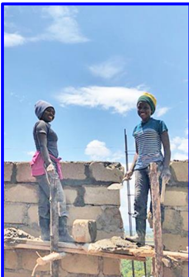
NOTE: THERE ARE TWO WOMEN WORKING ON THE SCHOOL - - BOTH MASONS. NEARLY 50 WORKERS ARE AT THE SITE DAILY. YOUR DONATIONS ARE SUPPORTING THE SCHOOL AND THE LOCAL ECONOMY. MANY THANKS!!