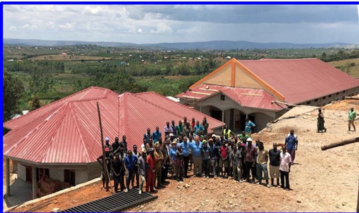
WORKERS, ADMINISTRATORS AND VISITORS ALL POSE FOR A PHOTO ON TERRACE THAT WILL EVENTUALLY BE A GRASSY GATHERING AREA IN FRONT OF THE CLASSROOM BLDG. WHAT A VIEW!