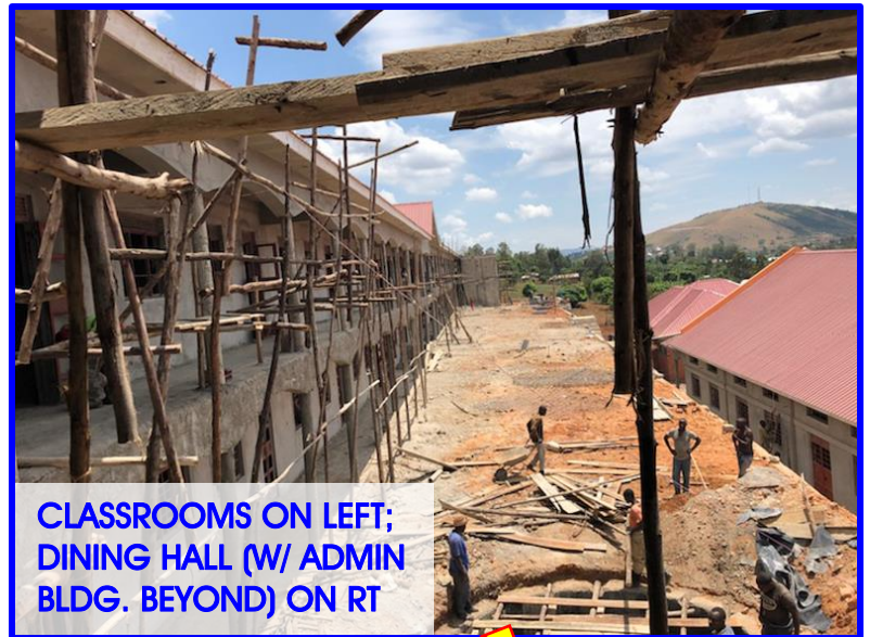
CLASSROOMS ON LEFT; DINING HALL (W/ ADMIN BLDG. BEYOND) ON RT