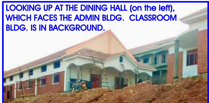
LOOKING UP AT THE DINING HALL (on the left), WHICH FACES THE ADMIN BLDG. CLASSROOM BLDG. IS IN BACKGROUND.