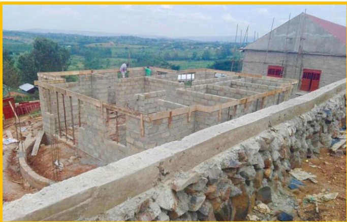
Above: The administration building is going up next to the dining hall. In foreground: the retaining wall, vital to prevent erosion on the sloped site.