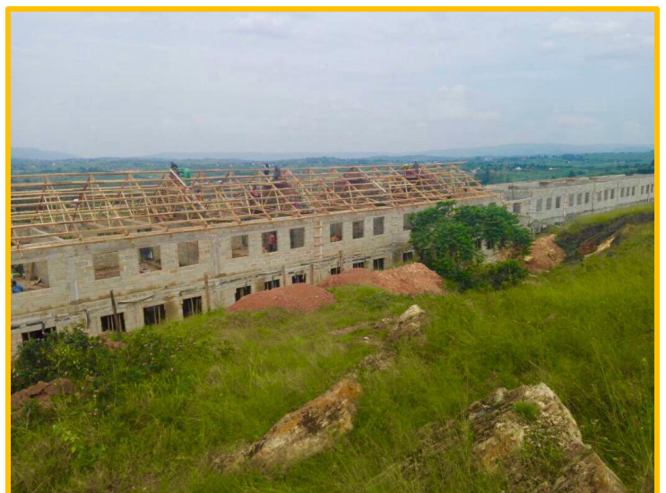
Above: June 7, rafters extend halfway down the 100m long classroom block, in preparation for the roof to be installed. Once the structures are built, they will all need to be stocked with furniture and equipment.