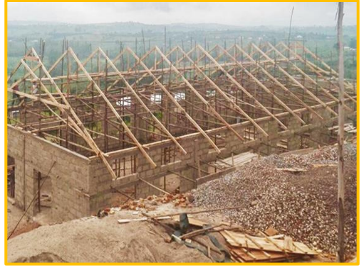
Above: Roof rafters on dining hall (April 23rd)